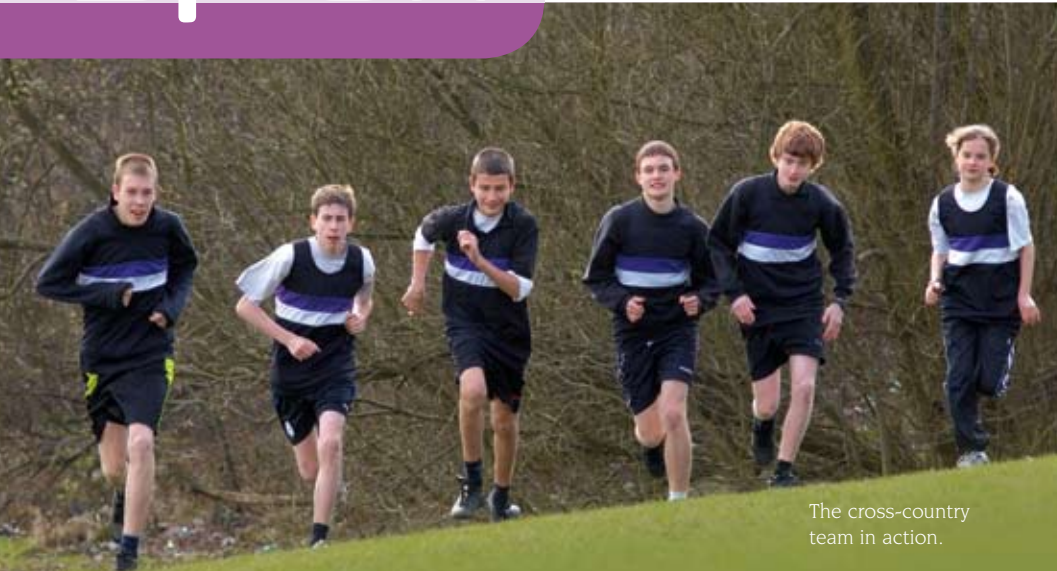
The cross-country team in action.