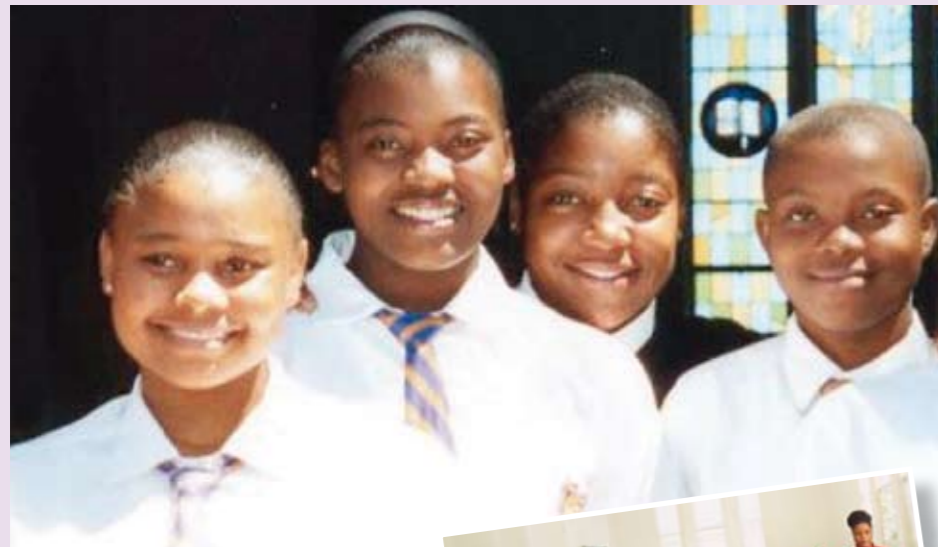
Partner pupils: Girls from the Inanda Seminary School.

FOLLOWING our visit to South Africa in October last year, we are delighted to be hosting three teachers, one from the Inanda Seminary, our partner school in Durban, and two from other local schools in the area.