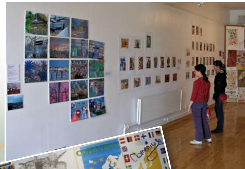
On display: Pupils look at works of art at the Workstation.