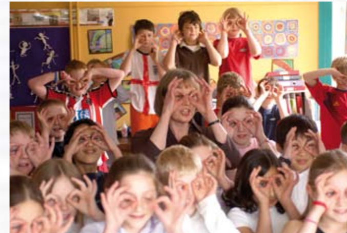
Dobcroft pupils take part in fun learning activities.

THE teaching of languages in our four feeder primary schools is proving to be an enjoyable and worthwhile experience for all concerned. At Ecclesall and Springfield, Year 6 pupils recently wrote their own mini monster books based on the Grand Monstre Vert storybook. At Dobcroft, Year