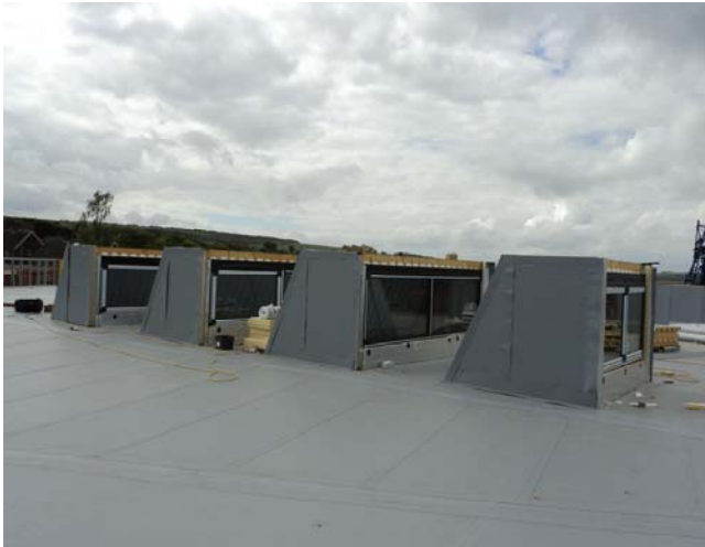
Above shows the external roof lights.