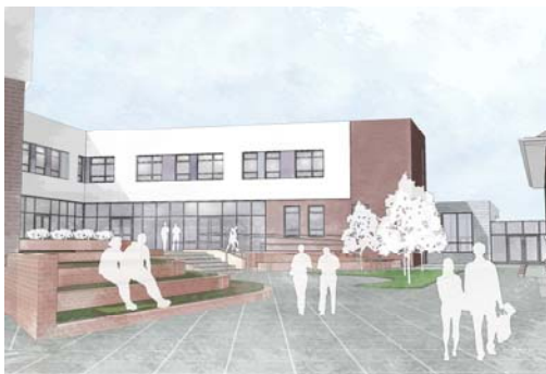
Above is an Artist impression of the Courtyard Link.