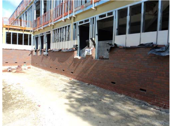
Above shows the first course of bricks being laid.