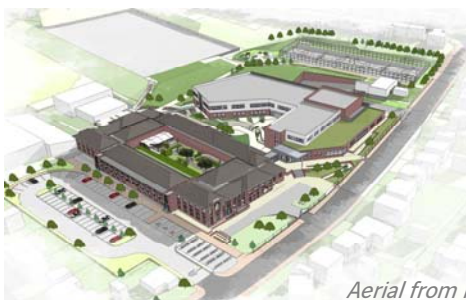
Aerial from North

Phase Five – Completion of the service yard and associated and external works.