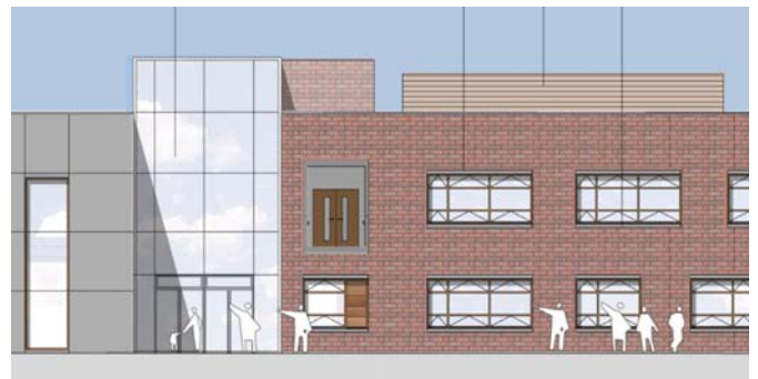
North Block – South Elevation