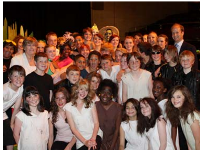
The cast of The Wiz

and timber cladding on the sports hall to compliment the existing ornate elevations of the listed building. The height of the new additions is limited to two storeys to respect the scale and massing of the existing building and the surrounding residential buildings. The new school is designed in keeping with the scope and aspirations of the BSF programme in providing internal spaces in the existing and new buildings which facilitates the current needs of the students.