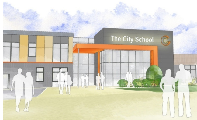
A view of the new City School main entrance