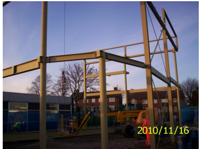
Block 1 - Start of structural steelwork