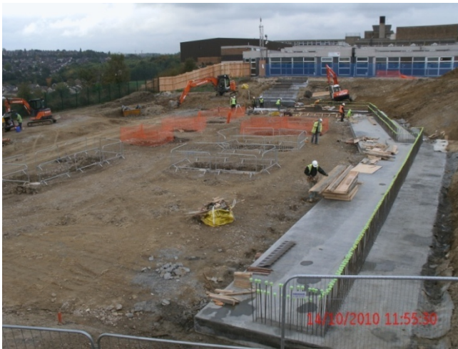
Block 1 - Lower Ground Floor Bulk Earthworks